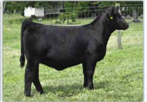
Lot 1 Progeny