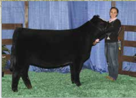
F27, Daughter of Lot 3 2018 Class Winner NAILE