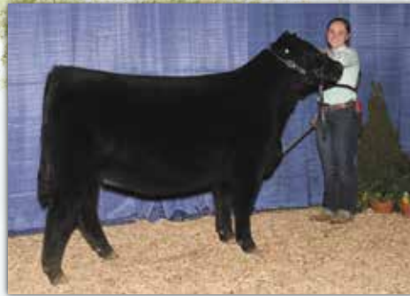
F35, Daughter of Lot 3 2019 Class Winner Kentucky Beef Expo