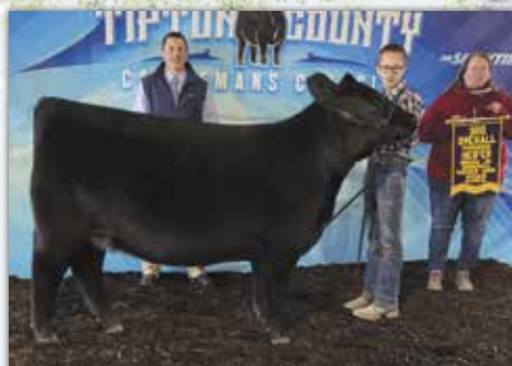
Purchased by Cash Rumble in the 2021 Clear Choice Sale