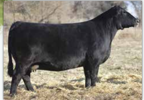
CLRWTR Losta Luv G422A Dam of Lots 13A & 13B