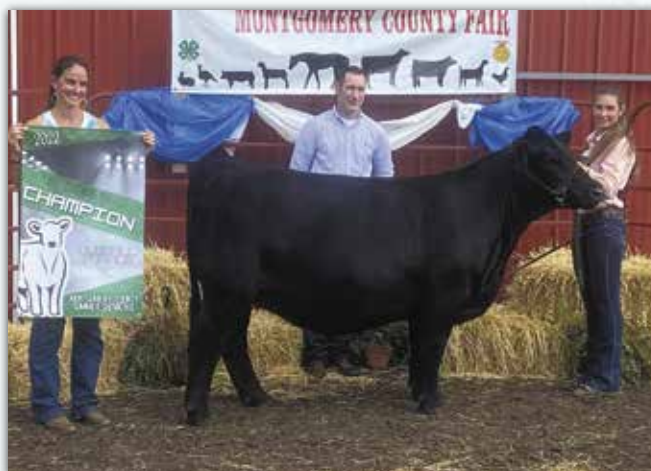
Besh Ms Firefly JN96