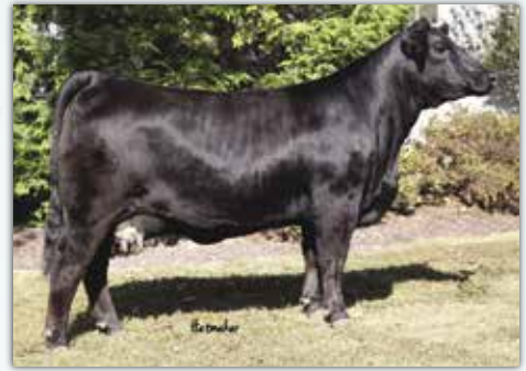
SS Emberly E303 Dam of Lots 5-8