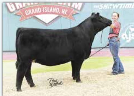
Full-sister to Lots 9A & 9B Purchased by Olivia Kuhn 2020 Clear Choice Female Sale