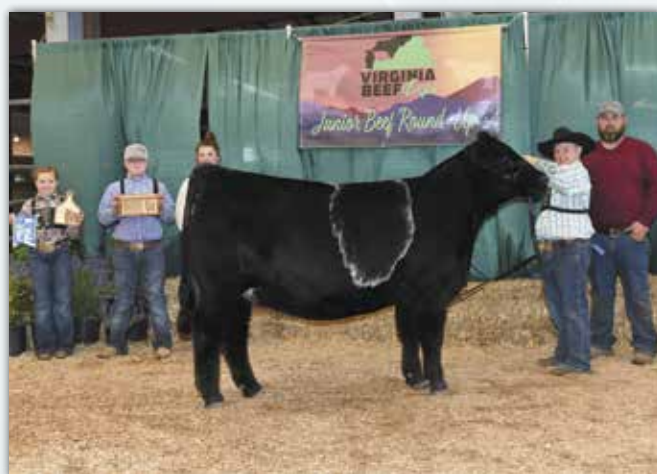
Besh Ms Soda JFM1

AI'd on 6/20 to CLRWTR Clear Advantage, PE to TJ Rage from 6/20/22 to 8/29/22 J302 is a Saban that goes back to a Hooks Taruras. This bred exhibits a long body and tidy neck and front. A heifer that includes some power however is smooth made.