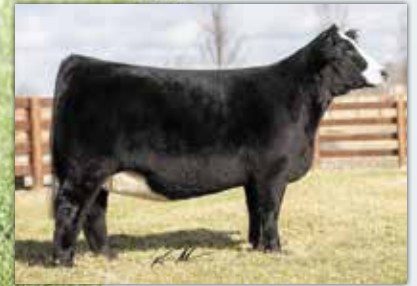
Dam of Lot 36