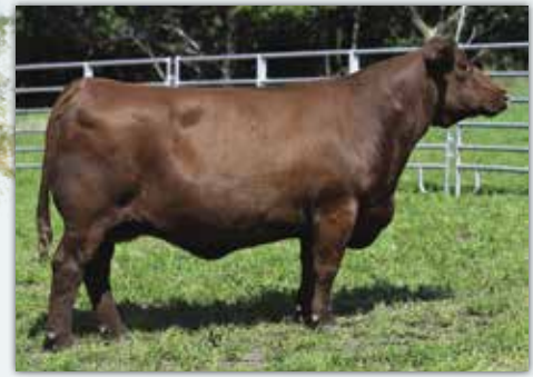
EKHCC Red Jewel 760 Dam of Lots 14 & 15