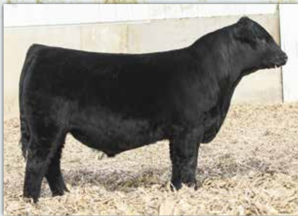
Besh Perspective - Son of Lot 2 Purchased by JS Simmentals, IA 2021 Clear Choice Bull Sale